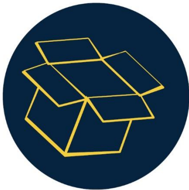
Packaging critical products

We're committed to ensuring the quality and safety of these products, manufacturing systems and many more