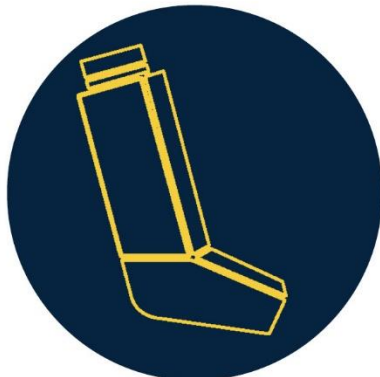
Testing medical devices