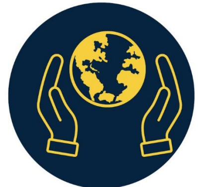
Environmental safety of antiviral pharmaceuticals