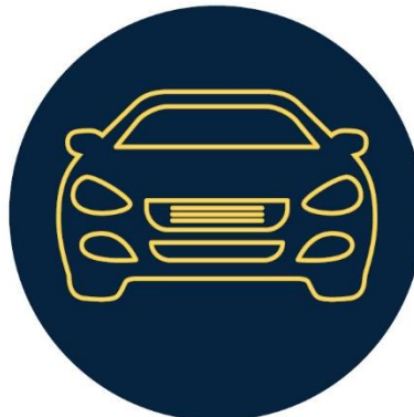
Testing essential components