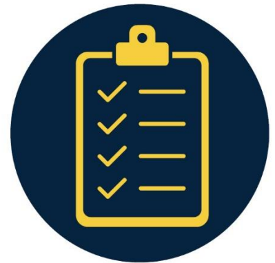
Audits for essential business continuation